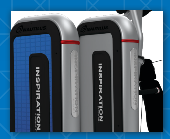
NEW MODERN DESIGN WITH UNIFORM TOWER HEIGHTS AND CUSTOMIZABLE SHROUDS