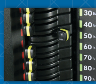
EASY TO USE LOCK N LOAD® TECHNOLOGY ELIMINATES LOST, BROKEN OR BENT PINS