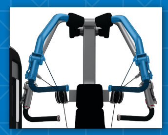
CONVERGING AND DIVERGING ARCS PROVIDE NATURAL FEEL