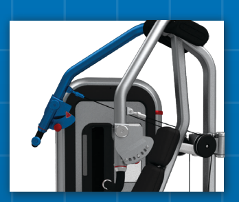
UNILATERAL AND BILATERAL MOVEMENT